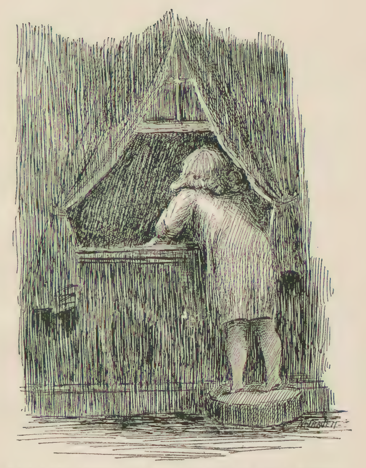
"MR. KHWIS KWINGLE, ARE YOU THERE? OR IS YOU A WOBBER?"